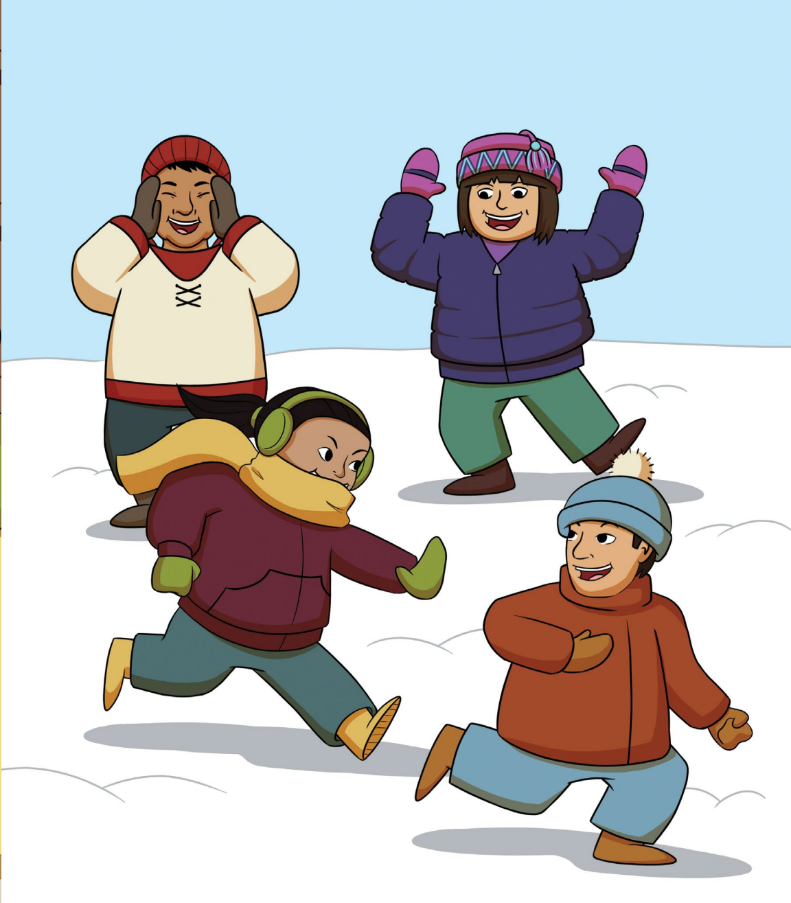
We play tag. We chase our friends.