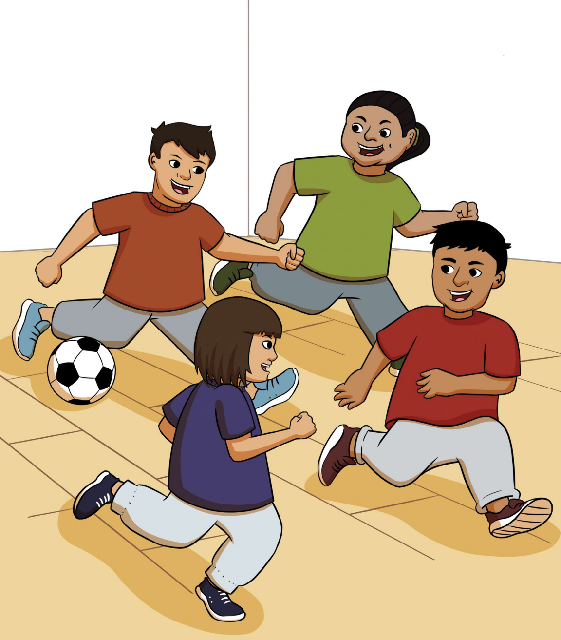
We like soccer. We kick the ball.