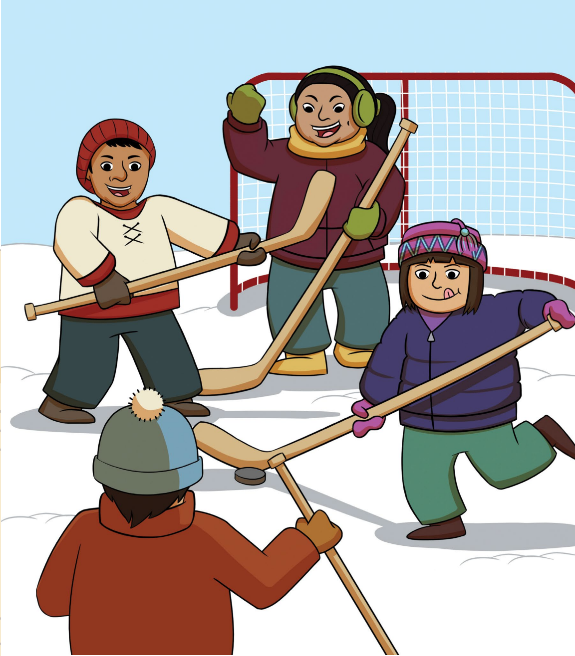
We like hockey. We pass the puck.