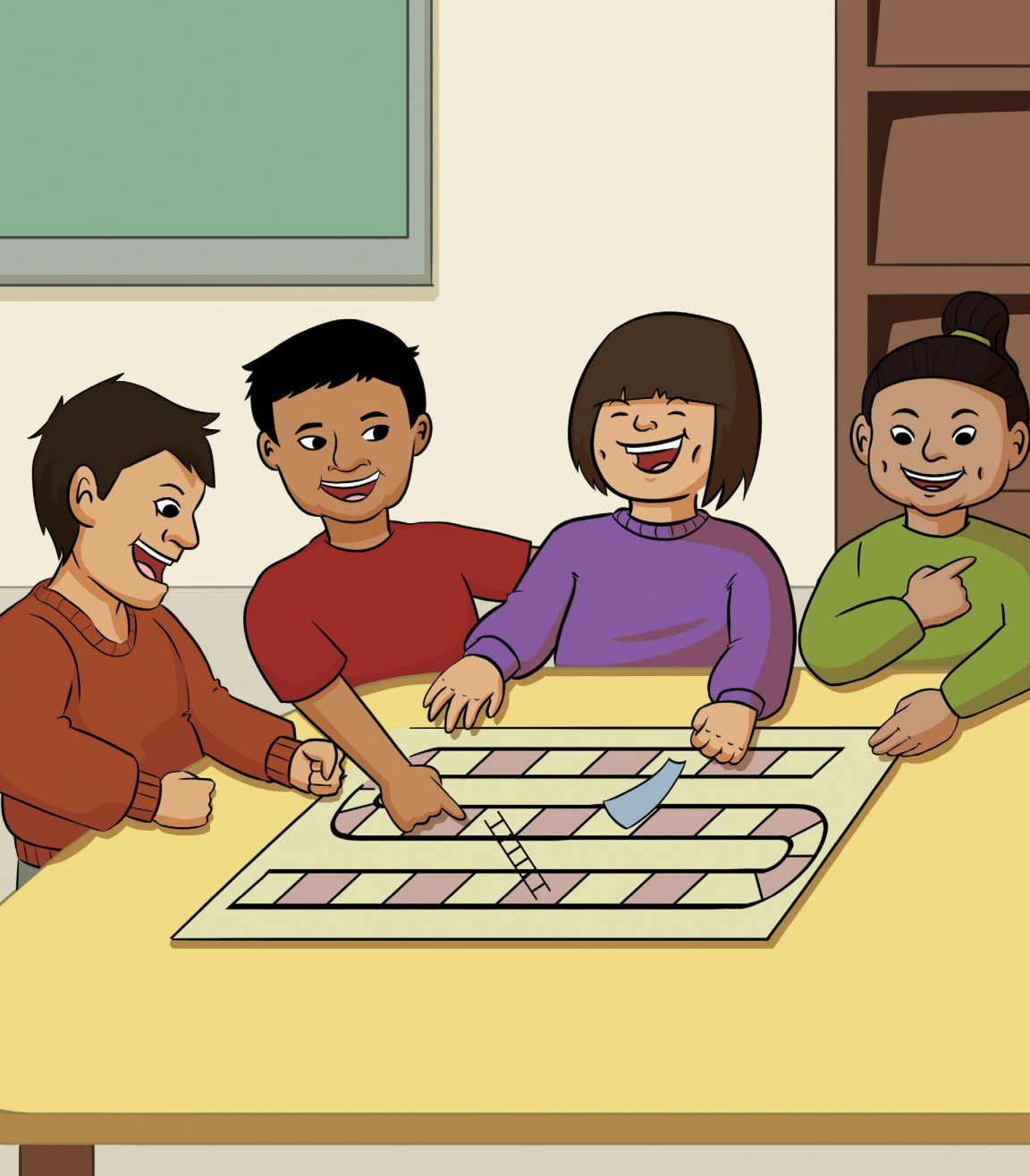
We like games. We take turns.