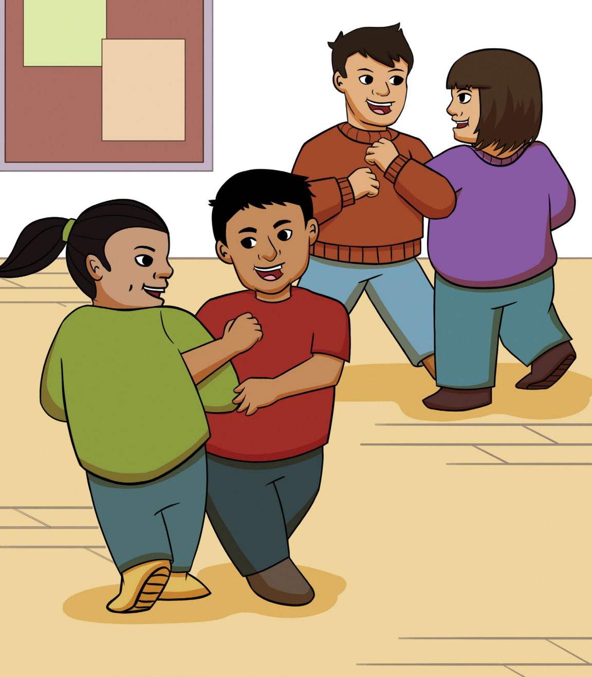
We like dancing. We turn to the music.