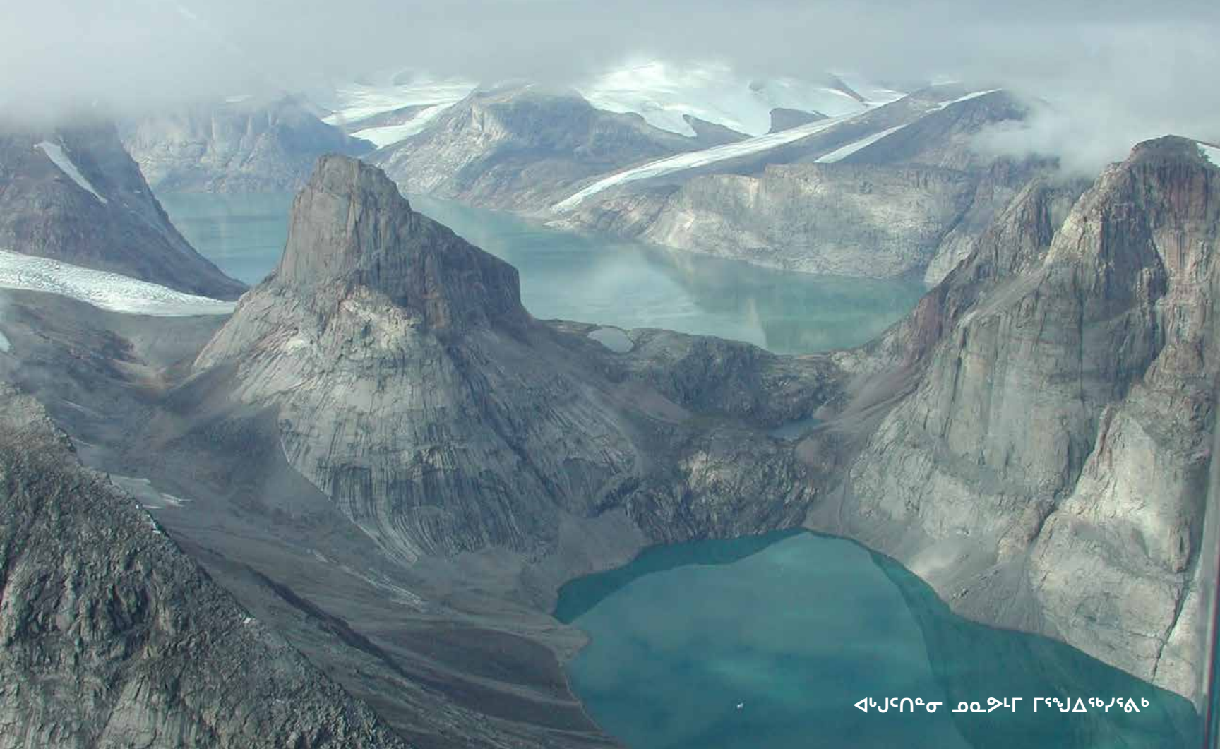
ᐱᓕᓕᓕᓕ ᓄᓇᓂᓕ ᓕᓕᓕᓕᓕᓕᓕᓕ