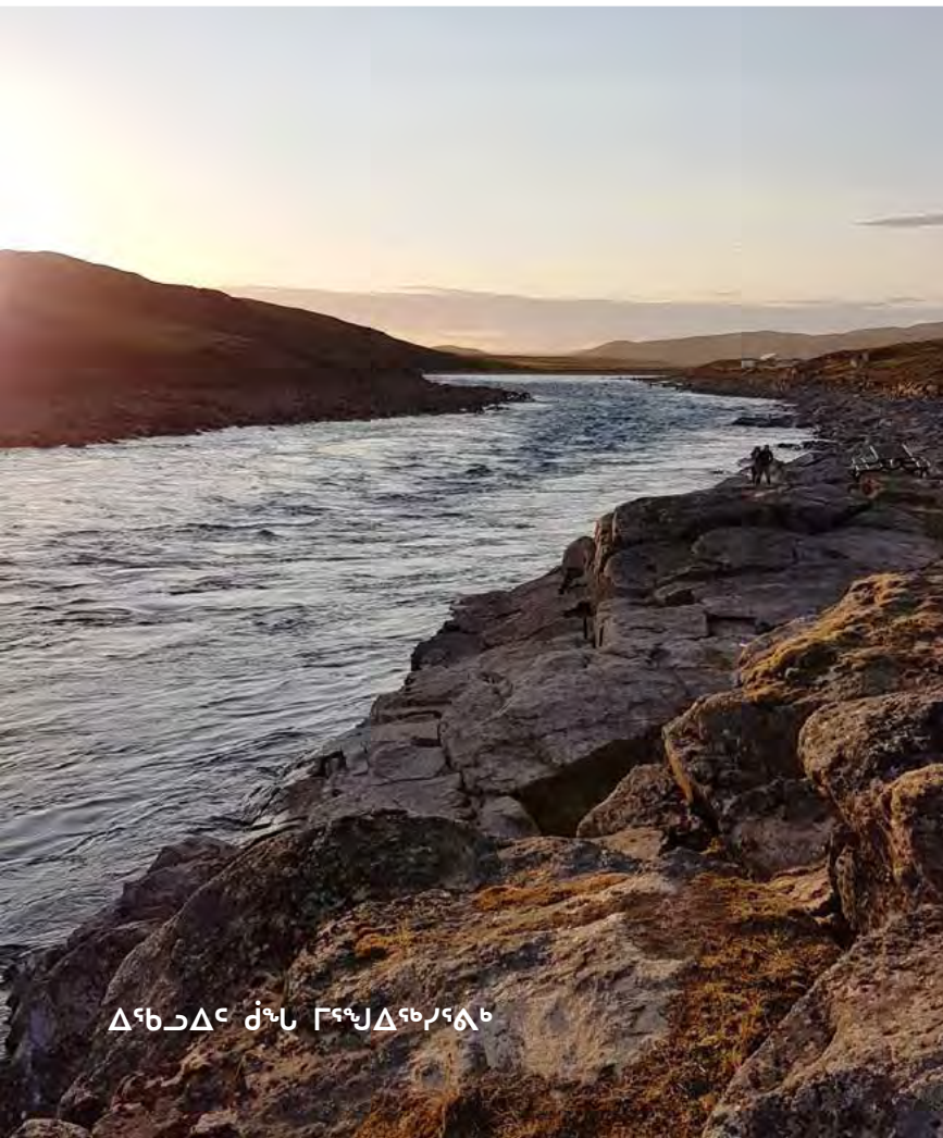
ᐱᓕᓕᓕᓕ ᓄᓕᓕ ᓕᓕᓕᓕᓕᓕᓕᓕ