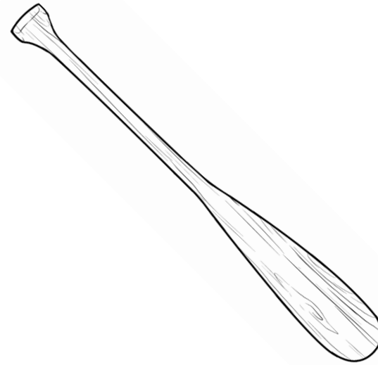
This is a paddle.