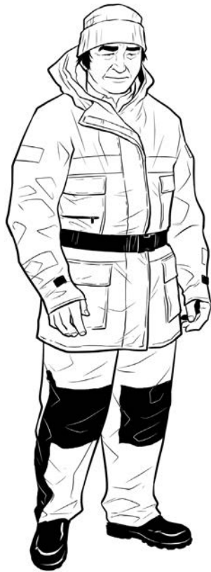
This is a floater suit.