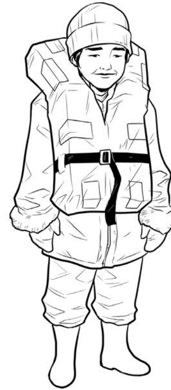
This is a life jacket.