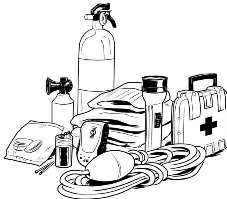
This is the safety equipment.