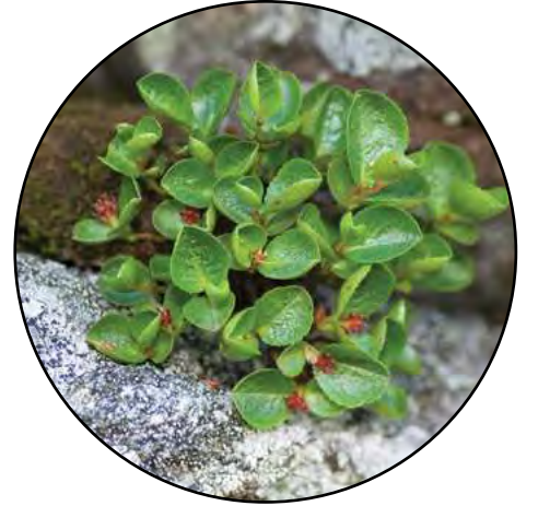
▷ ԳԵ▷ ԿՐ